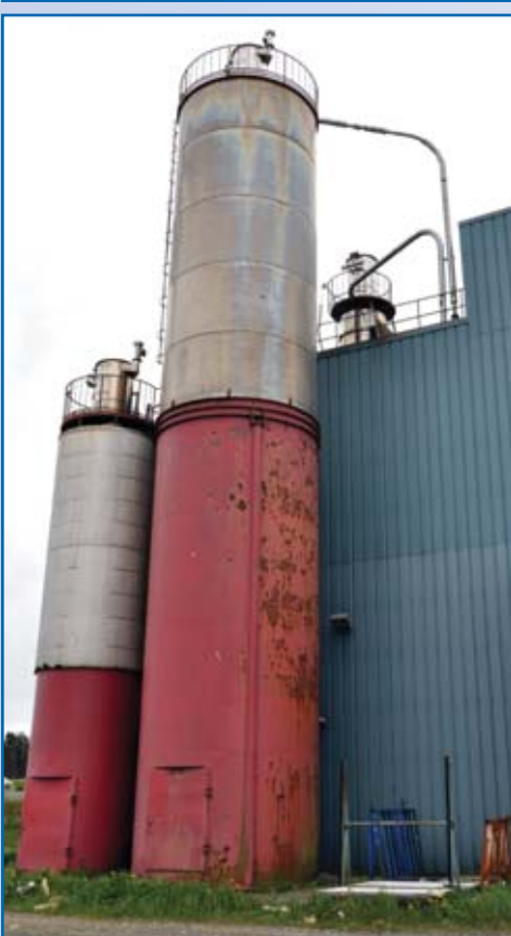
PVC Silo: Approx. 12' Dia. x 31' High Compound Silo: Approx. 7.5' Dia. x 19' High