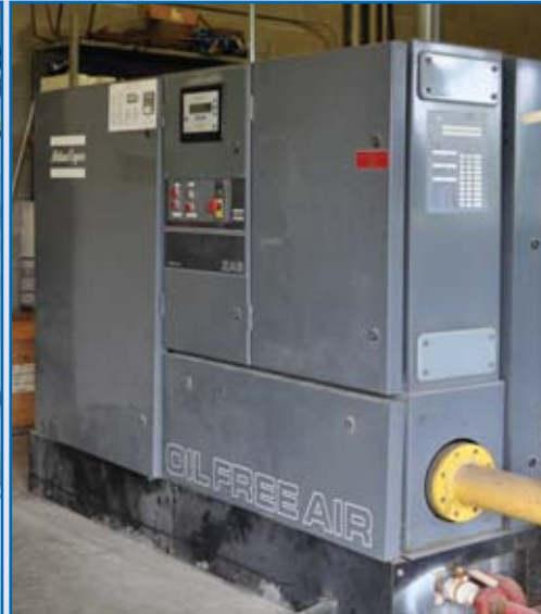
ATLAS COPCO 125 HP Air Compressor