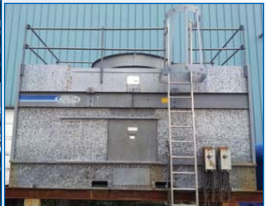
MARLEY Outdoor, Cooling Tower, Model 221, Ground Mounted, sn 51445/90, Plus Assorted Pumps, Piping Etc.