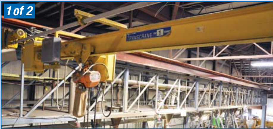
TRANSCRANE 1 Ton Cranes, 35' & 17' Width

(2) TRANSCRANE 1 Ton Cranes, 35' & 17' Width, 1 Ton Richard Wilcox Electric Hoist, Single Girder, Runway and Buzzbar not included