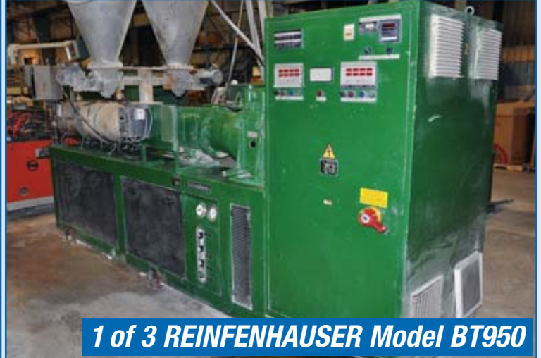
1 of 3 REINFENHAUSER Model BT950