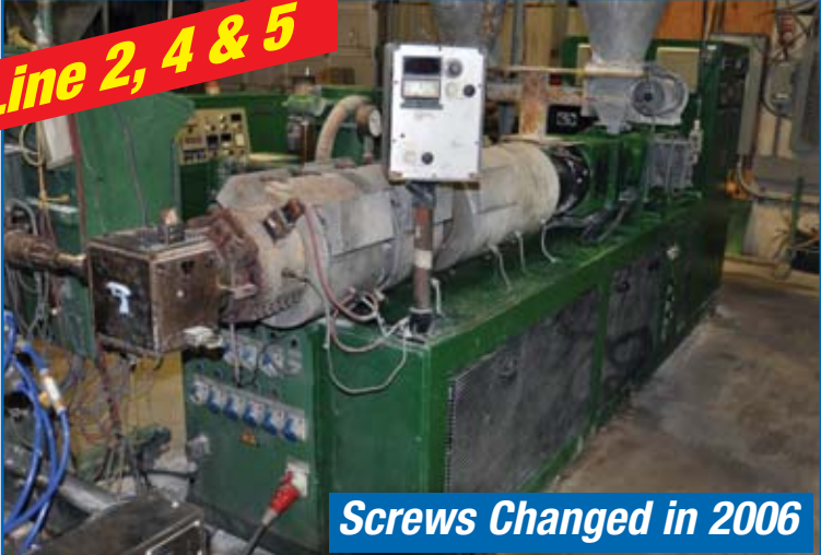
Screws Changed in 2006