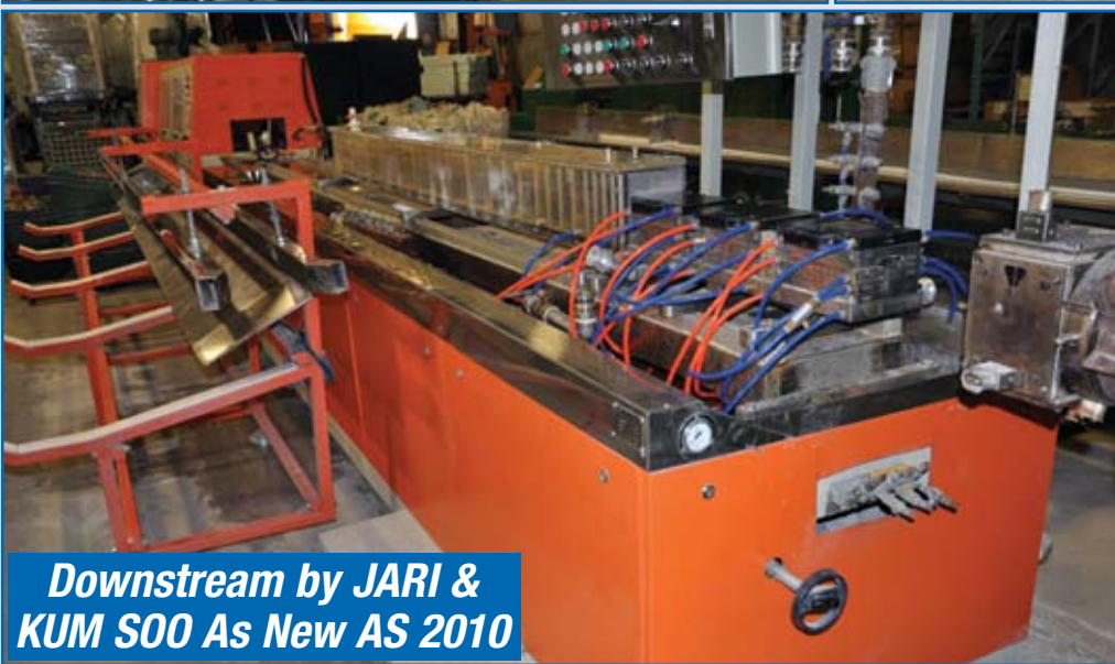
Downstream by JARI & KUM SOO As New AS 2010