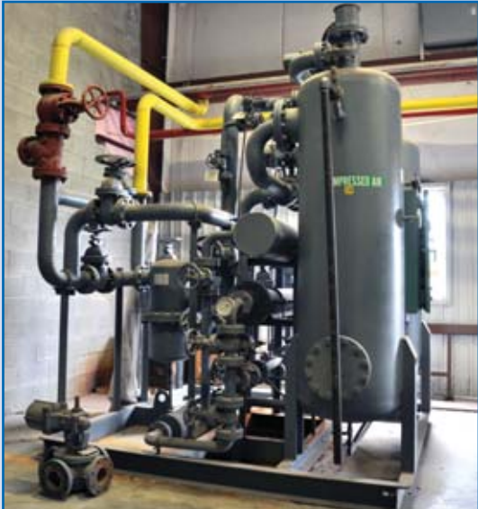
GALAXY Air Dryer, Model 905EH-023

Scissor Lift Table - Table Size: 98" x 30", Lift Height: 60"