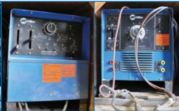
View of Assorted Miller & Welding Point Welders