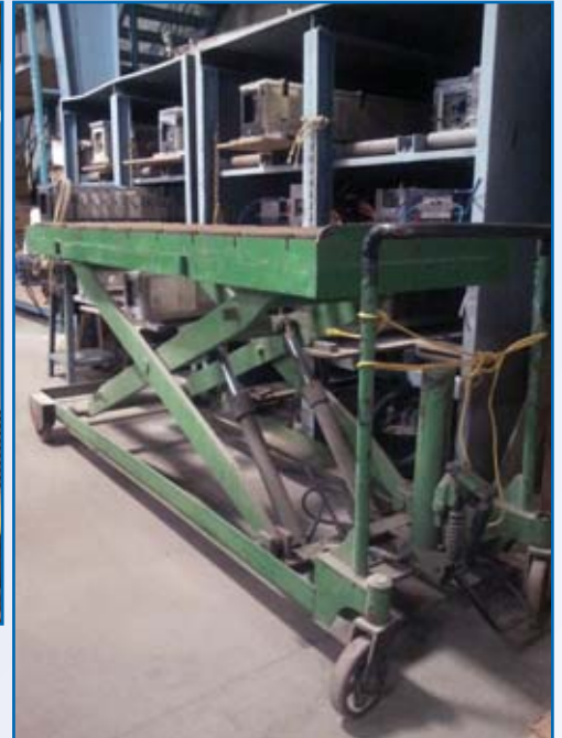
Scissor Lift Table: - Table Size: 98" x 30", Lift Height: 60"